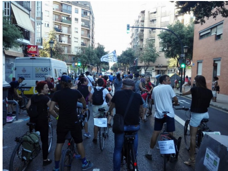
Demonstrating on bicycles across the city to the Lidl supermarket

Returning empty bottles. Another way to reduce the consumption of energy is to return empty bottles to the store so they can be washed and reused. This old system does not exist any more in Spain. AMA organised an action simulating the return of bottles in front of a Lidl supermarket to raise awareness among the customers about waste contamination and the unnecessary use of energy, put pressure on the packaging industry which is strongly opposed to it, and reopen the debate in the local media.