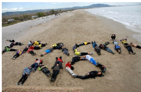
Demonstrating in Castellon