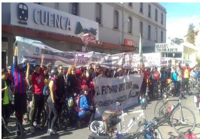
Cuenca, only 200km from Valencia, one hour with the fast train, but four and a half for passengers who want to travel with a bicycle, with one or two trains per day, and only nine bicycles per train.