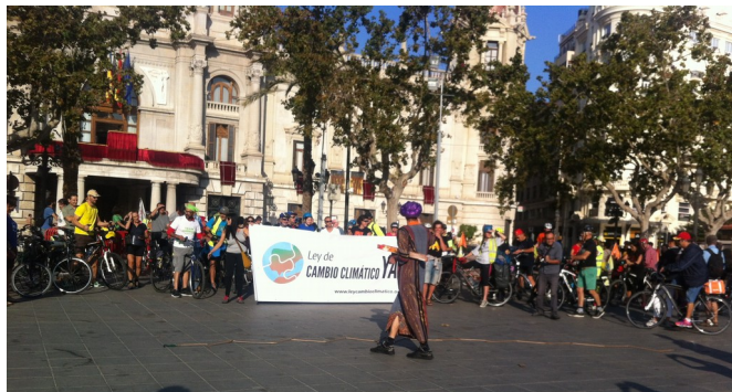
Valencia, 2016, departure by the city-hall to the COP22, with the mayor present