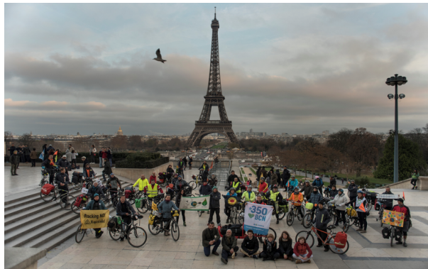
COP21, Paris, 2015