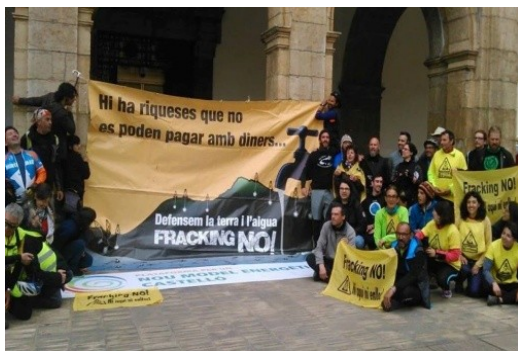
Anti-fracking demonstrating in Castellon: "There are treasures that money can't buy"