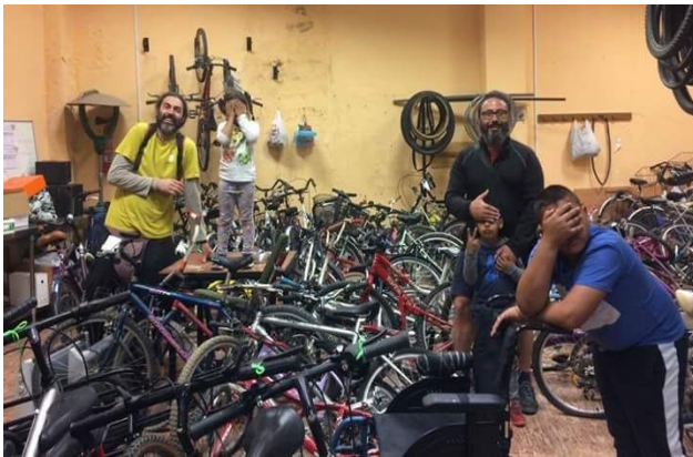
The workshop where bicycles are fixed

On the one hand this project aims at fostering solidarity among people and the use of a sustainable way of transport. On the other hand, it gives a second life to hundreds of bicycles with their kilos of material which would otherwise end up in municipal dumps in the best case.