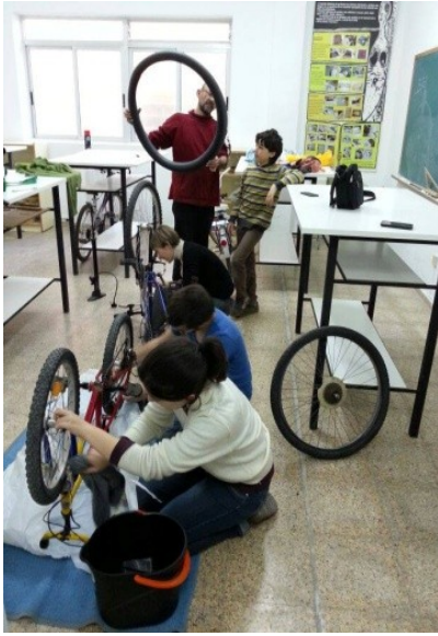
Teaching children how to fix a bicycle