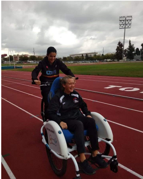
Showing how it works

Thanks to the financial assistance from various organisations Soterranya could implement this project which consisted in buying several adapted bicycles with the aim to giving greater mobility to people with physical disability and senior people. As a consequence they can enjoy a better social inclusion. These special bicycles are available to both individuals and associations. The project is to acquire more of these bicycles so that more people can be included and have access to sustainable mobility.