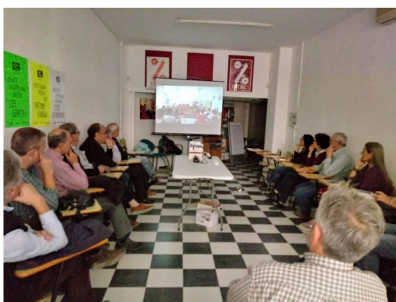
Conference-debate in collaboration with the association ATTAC