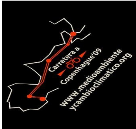
COP15, Copenhagen, 2009