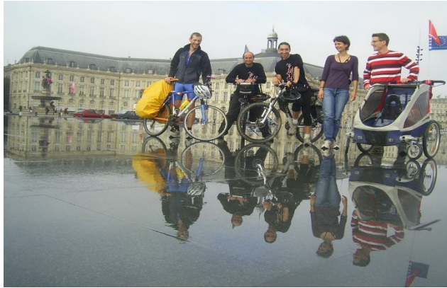
COP15, Copenhagen, 2009