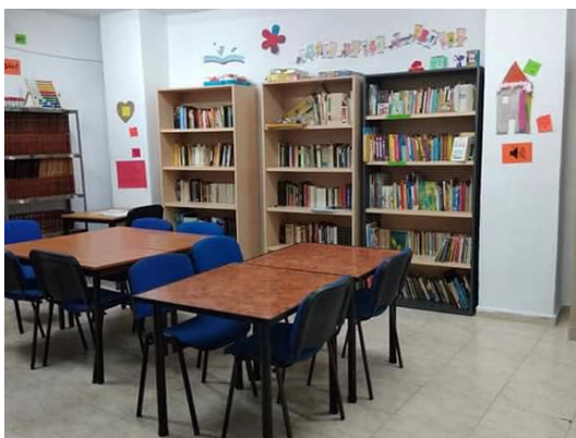
The library Armansallé