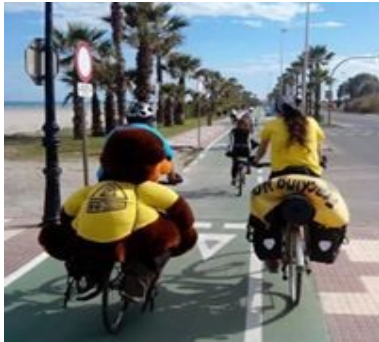
Anti-fracking, making the purpose of the march visible.

Anti-fracking demonstrations. AMA is concerned by contaminating energies. In this regard it organised, with other associations, several demonstrations against a fracking project, Castor, located off the Castellon city shore. After works started several small earthquakes occurred. The project has been suspended in 2014.