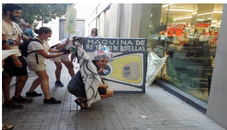
Simulating the return with a cardboard machine