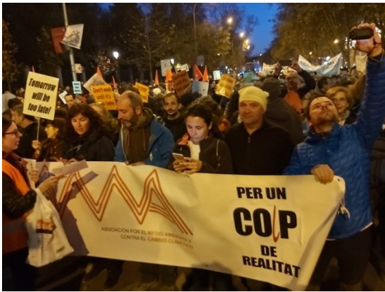
COP25, Madrid, 2019