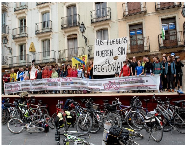
Alcoy, a university city, only 110km away from Valencia, but more than two hours and a half from Valencia by train and with only two trains per day.

AMA regularly runs on its own and/or with other associations – like users, disabled persons, railway union members and sometimes even with local mayors – demonstrations to demand that local lines be preserved and correctly maintained, that trains run more frequently, and that carriages be adapted. AMA also organises bicycles trips to promote the use of bicycles as a way of transport which does not produce CO 2 , whether in urban areas or to travel during holidays.