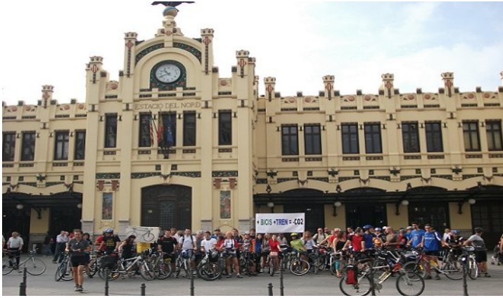
Valencia, demonstration in front of the station for local trains