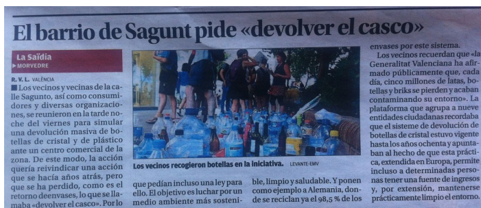
Article in the local press