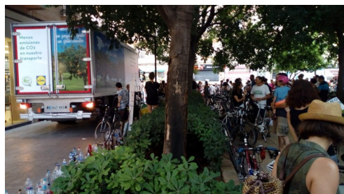
A Lidl truck unsuccessfully trying to disturb the action