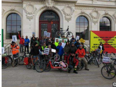
Les cyclistes espagnols, accueillis par des cyclistes poitevins, ont fait une balade dans Poitiers et diffusé leur message pour promouvoir la bicyclette et la nécessité de sauver la planète.