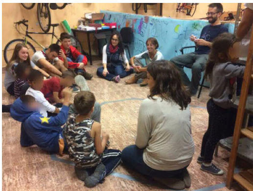
Performing activities with the children in El Xenillet

In 2018 Soterranya started a small library in the same space, Armansallé, with donated and collected books with the aim of using it as a learning tool for the children and making the space more attractive to adults. There are books in Spanish, Valencian, English, French and even Russian.