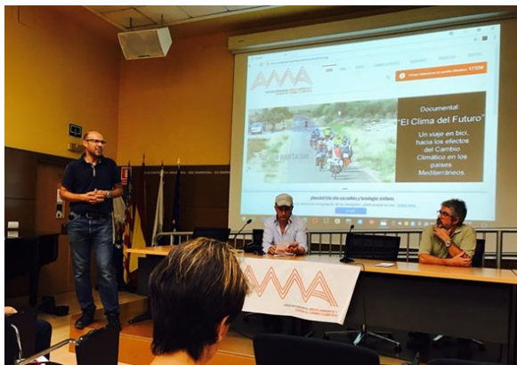
Conference at the University of Alicante